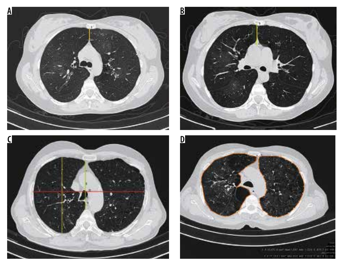
Figure 1. High-resolution computed tomography section of the thorax demonstrating quantitative parameters of chronic obstructive pulmonary disease. A) Anterior junction line, B) sterno-aortic distance, C) thoracic cage ratio, D) thoracic cross sectional area