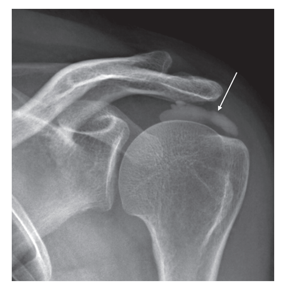
Figure 1. Conventional radiographic evaluation of left shoulder showing cloudy and dense calcification (arrow) of the supraspinatus/infraspinatus projective sites

toms due to the oedema, which causes increased intratendinous pressure and, in some cases, the extravasation of crystals in the sub acromion subdeltoid bursa (SASD);