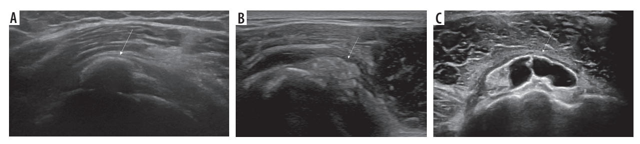
Figure 2. Ultrasound images showing hard (A), soft (B), and fluid (C) calcification (arrows)

• type III calcification: difficult to diagnose for their slightly isoechogenic pattern without posterior acoustic shadow.