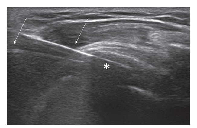
Figure 4. Image of 2-needle ultrasound-guided percutaneous irrigation of calcific tendinopathy (US-PICT) procedure showing needle tips (arrow) into the calcific deposit (asterisk)

In case of the 2-needle technique (Figure 4), the first needle is inserted with an in-plane approach and parallel to the probe into the caudal portion of the calcification with the needle bevel open upwards, while the second needle is inserted into the upper portion of the calcification