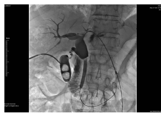
Figure 3. After the ablation balloon dilatation was applied at 12 atm to remove the intra-luminal necrotic tissue

[4-8 cm] and diameter [6-10 mm]) as the study group. In the same way, an 8F biliary drainage catheter was inserted for control cholangiography and removed after the demonstration of free bile flow. First-generation cephalosporine (Cefazoline, 1 g IV) prophylaxis was administered to all patients periprocedurally.