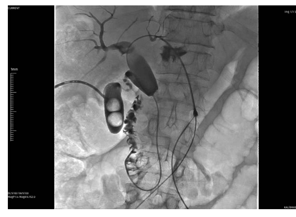
Figure 1. 73-year-old male patient with a diagnosis of pancreatic head cancer (adenocarcinoma). Cholangiography before the procedure showed occlusion of the common bile duct