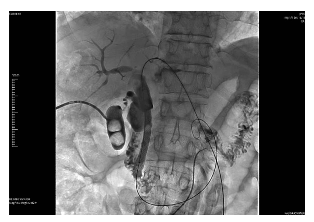
Figure 5. Following the stenting, balloon dilation was performed to open the stent sufficiently

patency or stent occlusion during follow-up were further treated with RF ablation, balloon dilatation and/or biliary drainage catheter insertion, or second stent placement as appropriate.