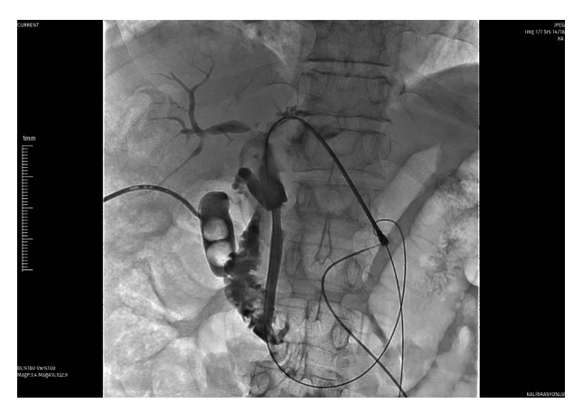
Figure 4. Self-expanding metallic stent (SEMS) was inserted over the 0.035inch guidewire, and control cholangiography showed contrast passage