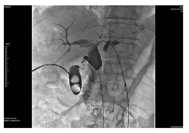
Figure 2. Radiofrequency ablation was performed to the distal common hepatic duct at 10 W

Stent patency and patient survival were followed up at regular intervals (first month, third month, and at three-month intervals). When laboratory parameters or clinical findings suggested cholestasis or cholangitis, patients were checked with fluoroscopy for suspected stent occlusion. Patients who were found to have insufficient