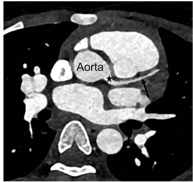
Figure 2. Axial multidetector thoracic angiography electrocardiogram-gated image in a one-year-old boy, showing normal left main coronary artery (star) arising from the aorta and left anterior descending artery (black arrow)

It was not properly visualized either at origin or in its course in 15 patients in group A (37.5%) and in 3 patients in group B (7.2%).