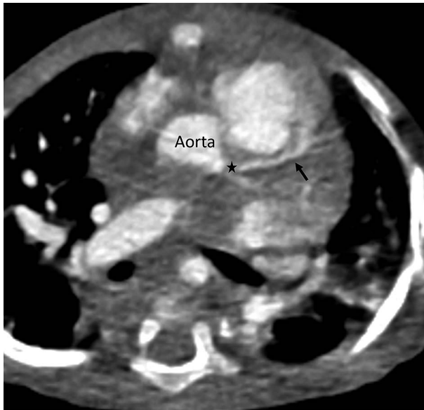
Figure 1. Axial multidetector thoracic angiography non-electrocardiogram-gated image in a one-year-old boy, showing normal left main coronary artery (star) arising from the aorta and left anterior descending artery (black arrow)