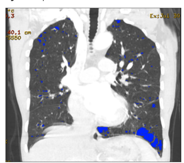
Figure 3. Scantily distributed areas of emphysema are shown in blue.