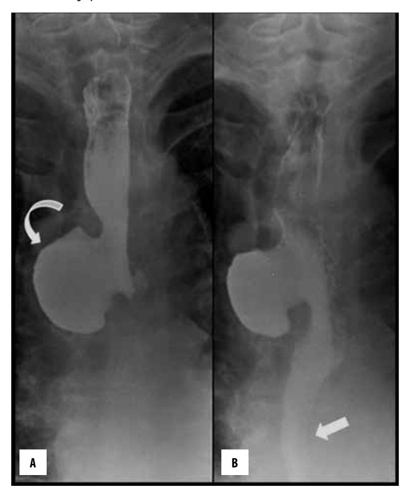
Figure 2. (A, B) Barium swallow showed large diverticulum arising from right lateral wall of mid esophagus (curved arrow) with normal appearing distal esophagus (solid arrow).

Mid-esophageal diverticulum with a large neck arising from the right lateral wall was visualized in upper GI contrast series (Figure 2A, 2B). Chest CT showed a diverticulum at the level of tracheal bifurcation with particulate