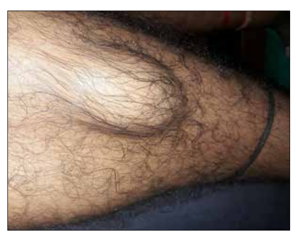
Figure 2. Clinical picture of the left leg — patient standing and straining leg muscles, shows a soft, non-tender swelling, measuring approximately 6.5×3.0 cm, on the anterior aspect of the leg.