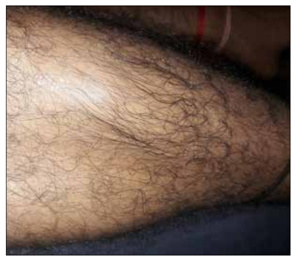
Figure 1. Clinical picture of the left leg — patient lying in the supine position, shows no obvious swelling in the leg (leg muscles relaxed).

Case Report © Pol J Radiol, 2017; 82: 293-295