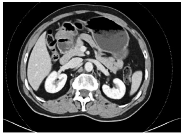
Figure 4. Axial abdominal contrast-enhanced venous phase computed tomography images acquired in dual-energy mode of a 60-year-old female with a body mass index of 22.3 kg/m2

erector spinae muscle by the image noise. To account for differences in tube voltage settings of SECT and DECT, figure-of-merit (FOM) values were calculated [3,9]. FOM values were calculated as the ratio of CNR<sup>2</sup> to effective radiation dose. These values were used for CNR assessment independent of ERD.