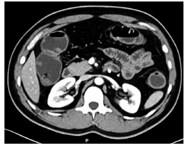
Figure 1. Axial abdominal contrast enhanced venous phase computed tomography image, acquired in single-energy mode, of a 34-year-old female with a body mass index of 22.15 kg/m<sup>2</sup>