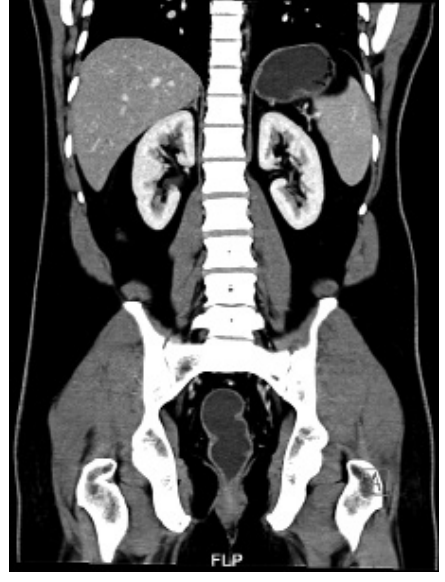
Figure 2. Coronal and sagittal reformatted abdominal contrast enhanced venous phase computed tomography images acquired in single-energy mode of the same patient

30-60 mm<sup>2</sup>), erector spinae muscle (ROI size, 50-100 mm<sup>2</sup>), and anterior abdominal wall subcutaneous fat (ROI size, 30-100 mm<sup>2</sup>) on 3 mm axial images of all 100 data sets. Areas with focal heterogeneity of contrast enhancement, focal calcification, and adjacent anatomical structures were excluded to facilitate homogenous measurements. The measurements were repeated 3 times to avoid data inaccuracies, and the mean values were calculated. The image noise was defined as the standard deviation of the fat.