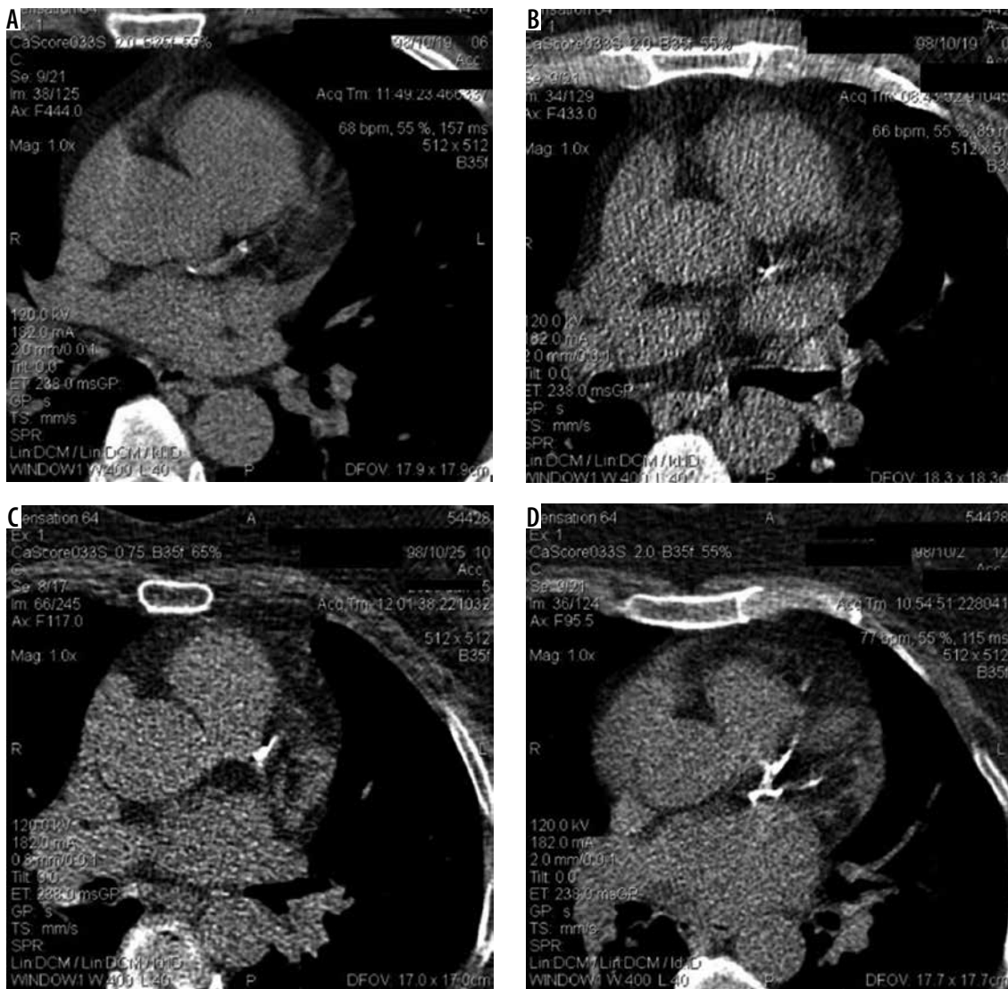
Figure 2. Coronary calcification score depicted in four female patients. A) Patient with calcium score of 1-10. B) Patient with calcium score of 11-100. C) Patient with calcium score of 101-400. D) Patient with calcium score of more than 400