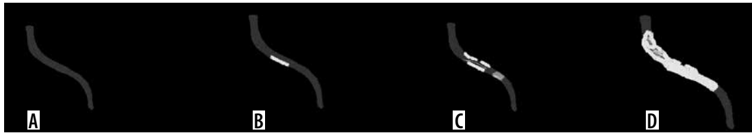
Figure 1. Schematic presentation of breast arterial calcification. The figures indicate increasing grade from A to D. The grading is done based on severity and density of calcium deposition in breast arteries