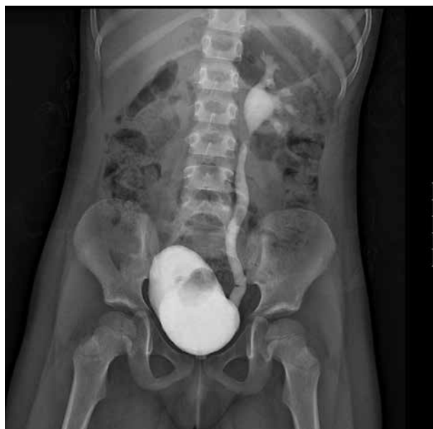
Figure 2. Voiding cystourethrogram. There was a grade 3 (high grade) reflux to the left kidney