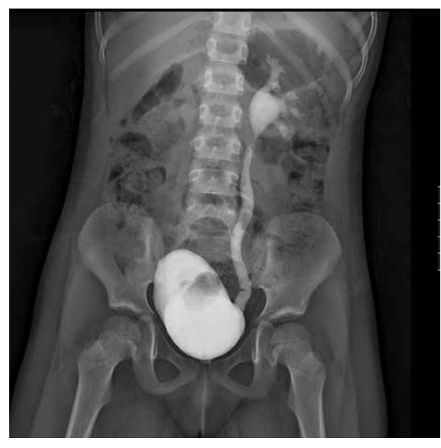
Figure 2. Voiding cystourethrogram. There was a grade 3 (high grade ) reflux to the left kidney

Table 5. The comparison of Urinary Tract Dilatation (UTD) and Society for Fetal Urology (SFU) classification for scar