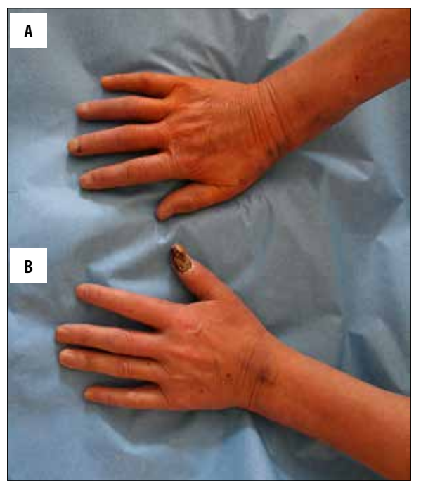
Figure 1. Ulceration on the palmar surface of the left thumb (A), small punctate ulcerations on other fingers and distal phalanx necrosis of the right thumb (B).

Comorbidities included: coronary heart disease (CCS III), myocardial infarction in 1990, chronic heart failure (NYHA IV), end-stage renal disease (dialyzed for 15 months), secondary parahypothyroidism, insulin-dependent type II diabetes, atrial fibrillation, hypothyroidism and chronic lower limb ischemia.