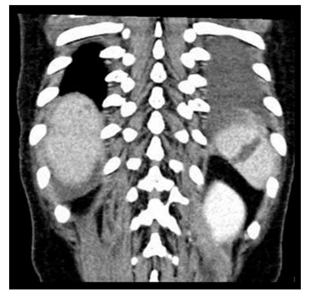
Figure 3. Coronal MPR image showing a small peripheral wedgeshaped hypodense lesion in the spleen suggestive of an infarct. Left pleural effusion and free fluid in the perihepatic space are also present.

There was no thrombus in the portal vein or in any of the porto-systemic collaterals. There were sub-centimetre lymph nodes in the omentum, porto-caval region and mesentery. The presence of partial splenic vein thrombosis warranted a work-up for a hypercoagulable state in the patient. The fibrinogen level was elevated to 17.64 \mu mol/L (normal 4.41–13.23 \mu mol/L). Prothrombin time was prolonged to 20 seconds (normal range 11–13.5 seconds), the INR was 1.7 (normal range is 0.8–1.1in people who are not on anticoagulant therapy). The levels of protein C, protein S, anti-phospholipid antibodies, anti-thrombin III, factor V Leiden mutation were all normal. Low Molecular Weight Heparin (LMWH) was instituted and the patient was kept under close ultrasound and Doppler follow-up. The thrombus was seen to resolve in 5 weeks.