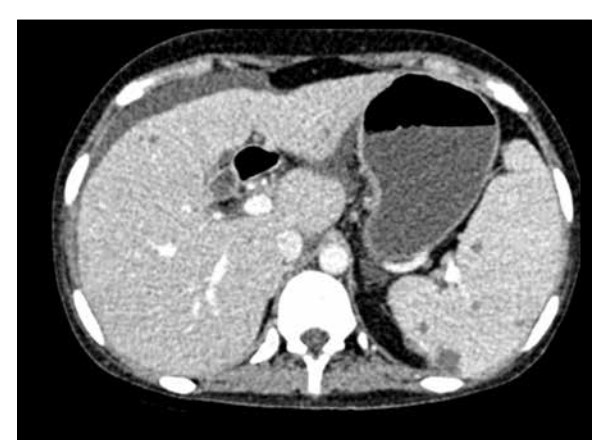
Figure 2. Multiple non-enhancing granulomatous lesions of varying sizes in the spleen, ascites and lesser omental nodes. Also seen are few sub-centimetre granulomatous lesions in the liver.

A partial linear filling defect was seen in the splenic vein which confirmed the presence of a partial thrombus, as shown in Figure 4A, 4B.