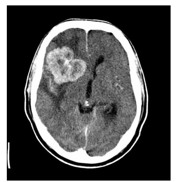
Figure 1. An axial CT scan of the head after i.v. contrast enhancement showing tumour mass located in right fronto-temporal region of the brain.

was surrounded by quite an extensive zone of oedema (Figure 1).