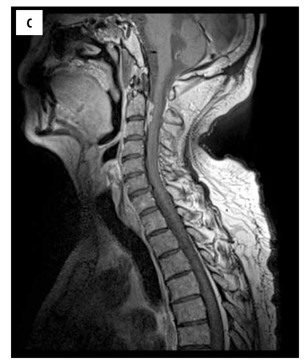
Figure 3. MRI of the cervical spine: Sagittal (A) and transverse (B) T2-weighted images of the cervical spine demonstrates two intradural extramedullary masses at the level of C2–C3 abutting the ventral aspect of the spinal cord. (C) Sagittal contrast-enhanced T1-weighted image shows an intense contrast enhancement of the masses, consistent with metastatic disease.

removed the brain tumour. Because of the infiltration of the right middle cerebral artery trunk, there was no possibility of a complete removal of the tumour. The size of the tumour required an extensive removal of the brain tissue and caused a large motor neurological deficit and an almost total dependence of the patient on other people as regards the basic life needs (Barthel ADL scale 3 points). The improvement was achieved through exercises such as breathing, passive proprioceptive priming by the PNF method, re-education, deep feeling by the Perfetti method, reinforcing the strength of the muscles of the left limbs and postural muscle using the platform and the rotor 4