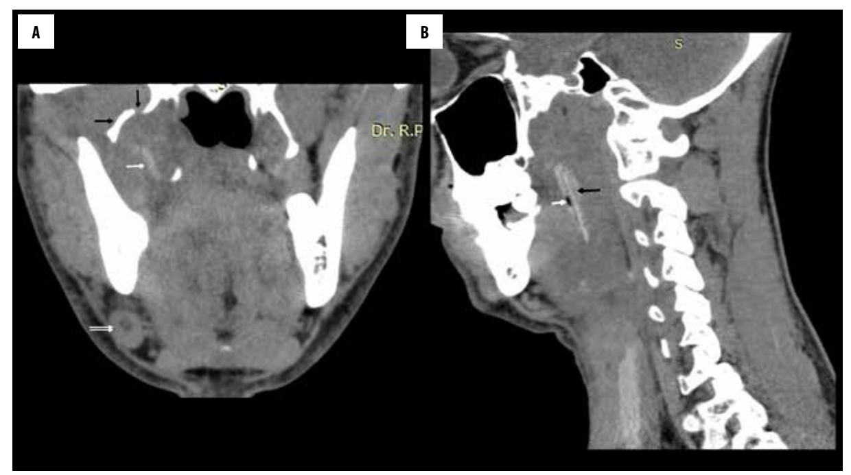
Figure 2. (A) Contrast-enhanced coronal reformatted CT image (WW 350, WL 60) showing a fracture (vertical arrow) and lateral displacement (horizontal arrow) of the right lateral pterygoid plate. A hyper-dense foreign body (white arrow) is also seen in the pterygoid fossa. An enlarged, peripherally enhancing lymph node is also seen in the right submadibular region (double arrow). ( B ) Contrast-enhanced sagittal reformatted CT image (WW 350, WL 60) showing a hyperdense foreign body (black arrow) containing foci of air (white arrow).