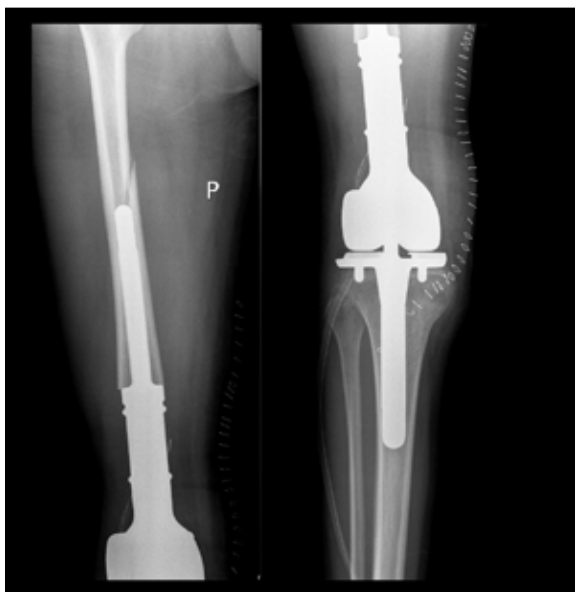
Figure 2. 17-year-old boy with femoral osteosarcoma one year after implantation of endoprosthesis. X-ray: fracture of the femoral stump.