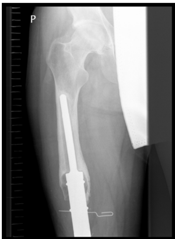
Figure 5. 26-year-old patient with femoral osteosarcoma five years after implantation of endoprosthesis. X-ray: loosening of the prosthesis at the level of the femoral stump.