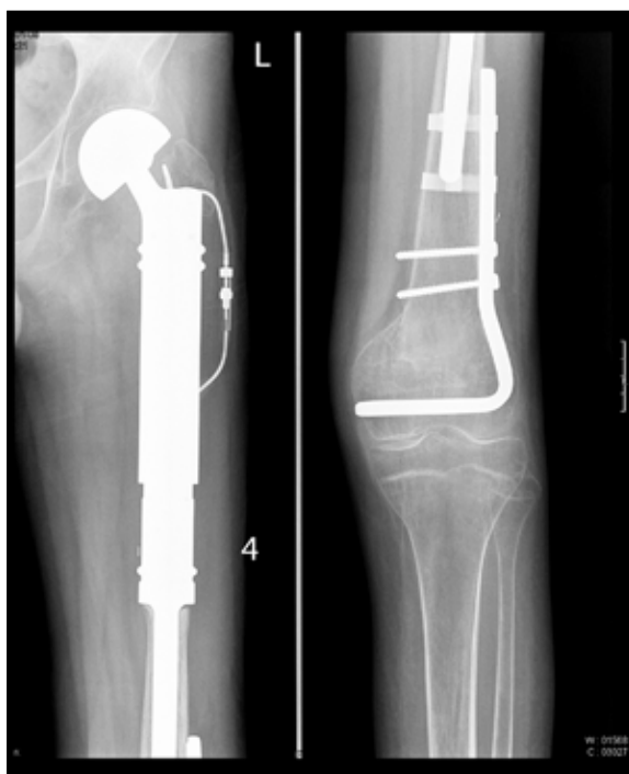
Figure 7. 16-year-old boy with Ewing's sarcoma one year after implantation of hip endoprosthesis. X-ray: osteolytic area in the medial femoral condyle. Disease recurrence was diagnosed.

of cancers (e.g. lung cancer), radiation exposure in children is less significant than in adults [4]. However, it is certain that 25% of cancers in children are associated with a