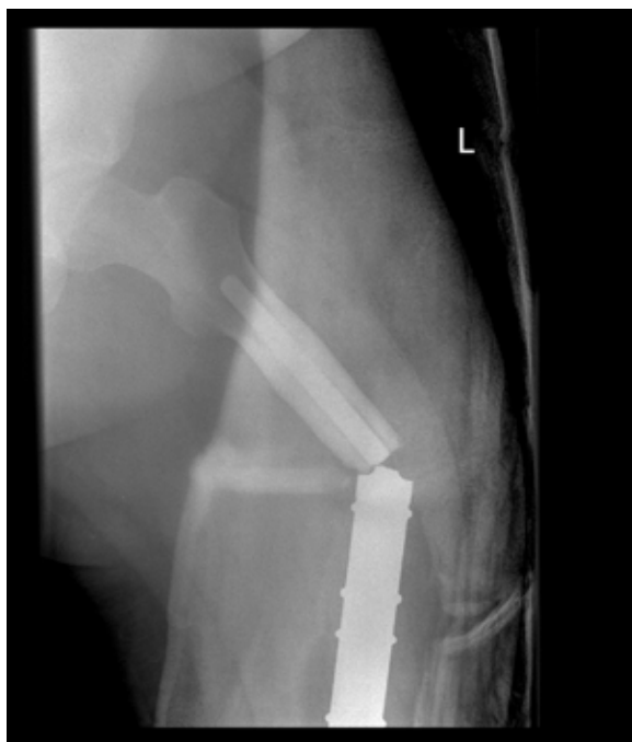
Figure 4. 16-year-old boy with femoral osteosarcoma six years after implantation of endoprosthesis presenting after trauma. X-ray: fracture of the prosthesis.