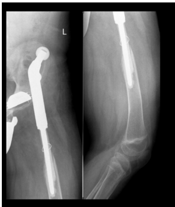
Figure 6. 19-year-old boy with femoral chondrosarcoma one year after implantation of hip endoprosthesis. X-ray: joint dislocation.