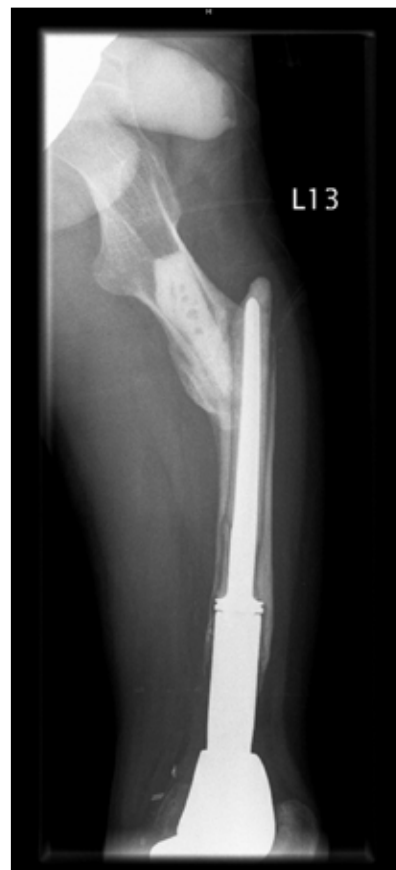
Figure 3. 17-year-old boy with femoral osteosarcoma one month after implantation of endoprosthesis. X-ray: fracture of the femoral stump.

According to the report of the United Nations Scientific Committee on the Effects of Atomic Radiation (UNSCEAR), the widespread belief that children are generally 2–3 times more sensitive to ionizing radiation than adults in the context of malignant tumors formation is not fully correct, since in 15% of cancers (e.g. colon cancer) susceptibility of children is comparable to that of adults. Similarly, in 10%