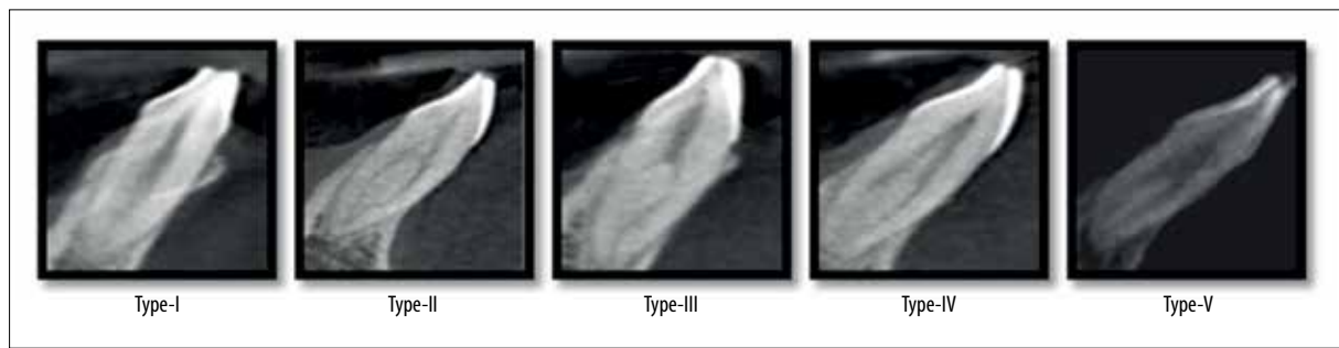
Figure 2. CBCT images showing the five variants in permanent mandibular incisors according to the Vertucci's classification.