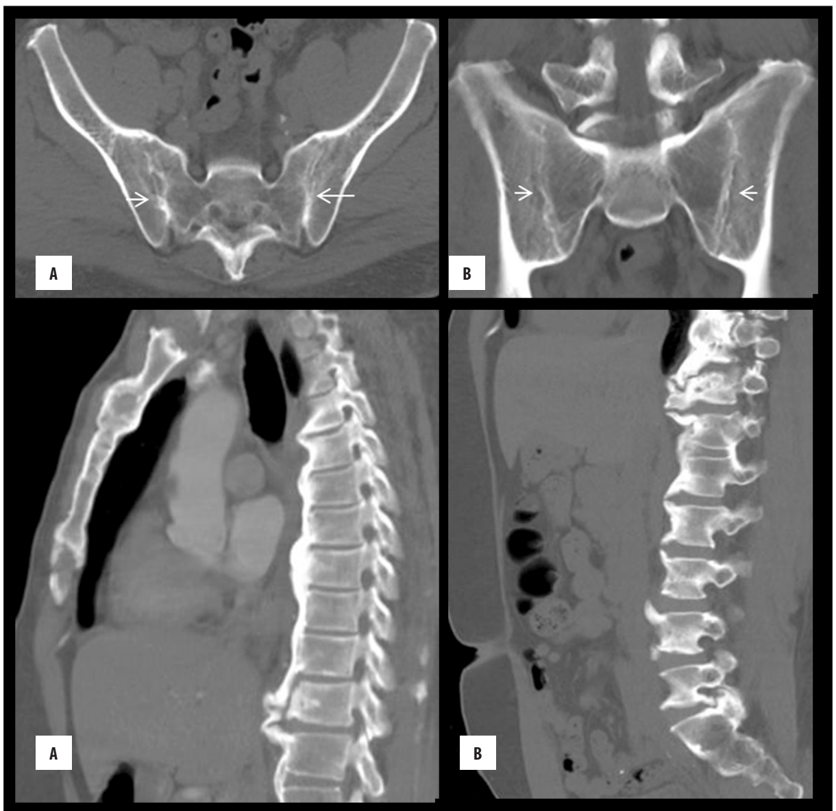
Figure 5. CT of the pelvis and spine demonstrates features of seronegative spondyloarthropathy in a patient with hidradenitis suppurativa. CT of the pelvis — axial ( A ) and coronal ( B ) images demonstrate asymmetric (left>right) ankyloses in the sacroiliac joints. CT of the thoracic spine ( C ) and lumbar spine ( D ) demonstrates marginal syndesmophytes.