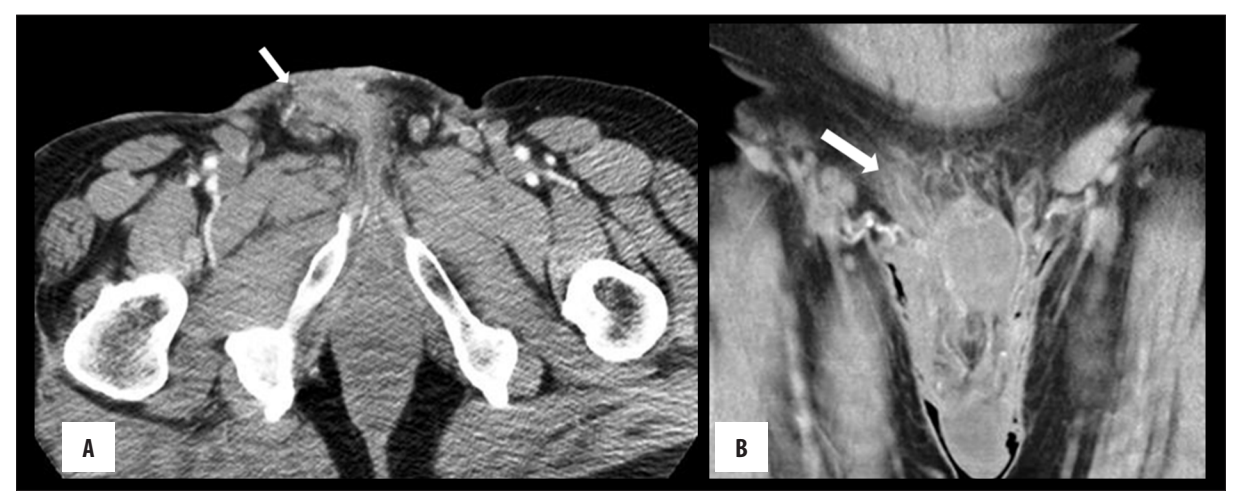
Figure 3. CT of the abdomen and pelvis demonstrates features of hidradenitis suppurativa: ( A ) axial image demonstrates a thick-walled, low-attenuation collection in the subcutaneous tissues of the right penile base, with thickening of the overlying skin; ( B ) coronal image demonstrates abnormally enhancing soft tissue infiltration in the subcutaneous fat of the right penile base (arrow), reactive hyperemia on the left penile base, and bilateral inquinal lymph nodes.

reduce tissue hypoplasia or aplasia resulting from the presence of a lethal mutation in a limb bud cell line, as the cells non-affected by the mutation would continue to develop normally. The extent of deformity in mosaicism depends on the timing of mutations. Late mutations produce only localized skin and soft tissue anomalies, whereas early mutations may result in severe chest wall and limb defects. Genetic counseling is not standardized for PS, as it is difficult to assess recurrence risk due to sporadic and familial occurrence.