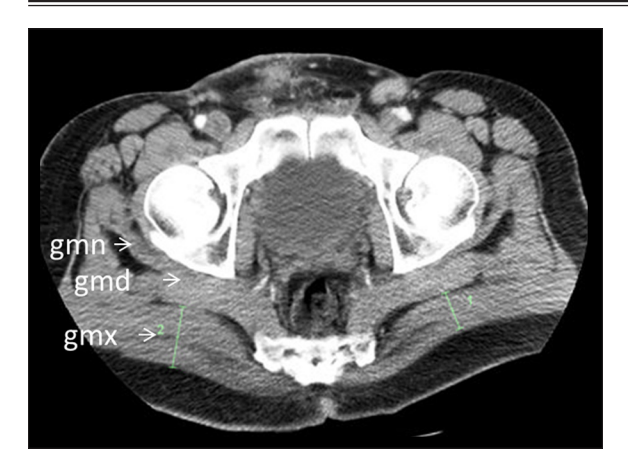
Figure 4. Contrast-enhanced CT of the pelvis demonstrates hypoplastic left gluteal muscles (compared to the right side). Note that the difference between the left (1) and right (2) gluteus maximus (gmx) muscles is obvious, whereas the differences between gluteus medius (gmd) and gluteus minimus (qmn) muscles are subtle.