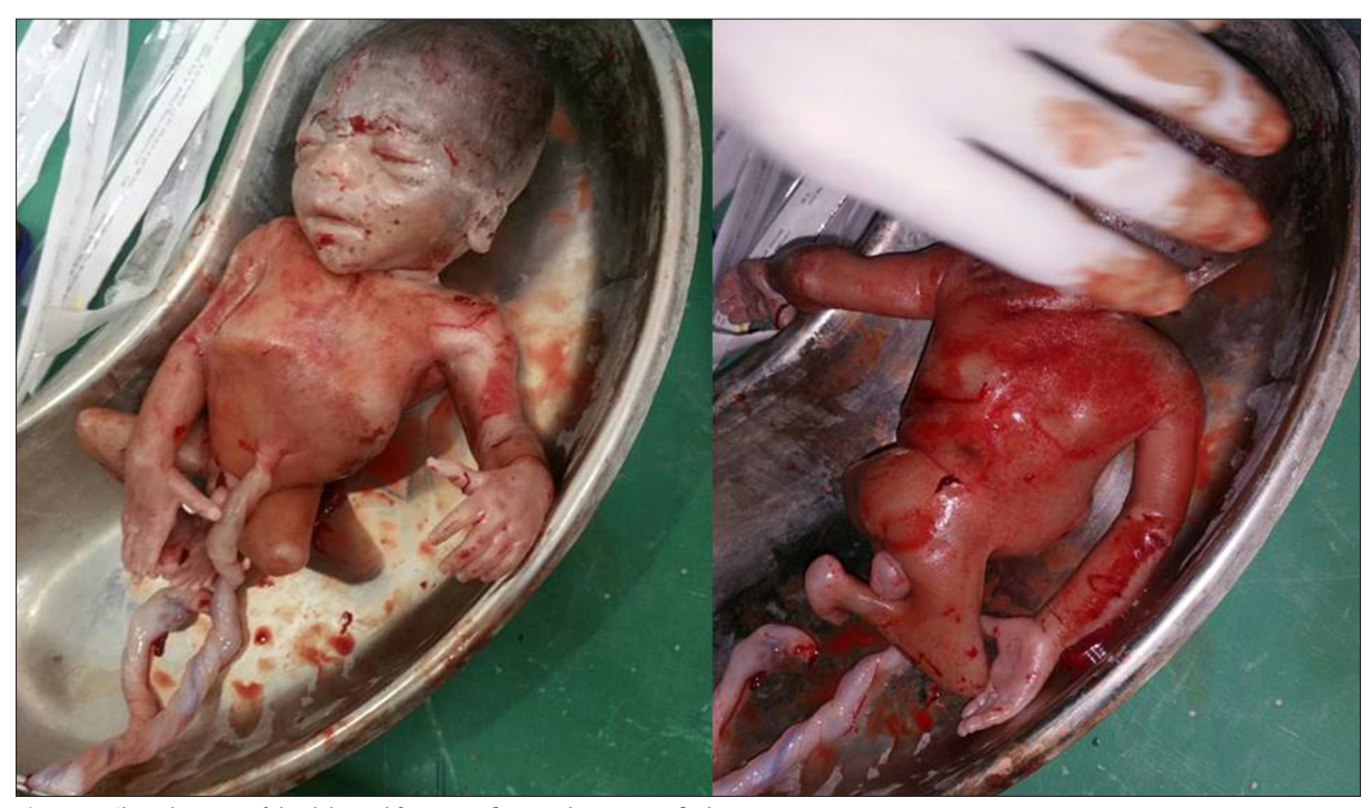
Figure 3. Clinical picture of the delivered foetus confirming the imaging findings

developmental anomalies of the caudal vertebrae, lower limbs, digestive and urogenital organs, and it causes significant neural tube defects. The severity of this syndrome varies from the absence of the coccyx to the involvement of sacrum or complete lumbosacral agenesis. Other anomalies associated with this syndrome are orthopaedic, anorectal (imperforate anus), vertebral, genitourinary (bladder exstrophy), and cardiopulmonary. Other anomalies include the VACTERL syndrome (anomalies of vertebrae, anus, cardiovascular system, tracheooesophageal fistula, renal agenesis,