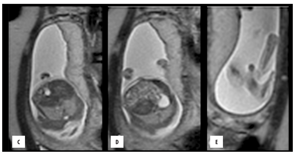
Figure 2. Foetal T2WI MRI (non-contrast images): (A, B) Sagittal sections of the foetus showing abrupt termination of the spinal cord and absence of the lumbosacral spine. (C, D) Axial sections of the foetal abdomen showing abrupt termination of the spine at the level of the stomach bubble. (E) Section of the foetal limbs showing clubbed feet.