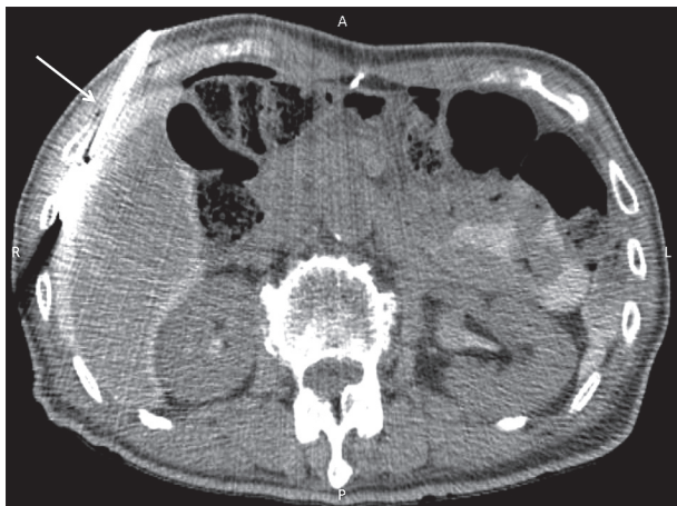
Figure 3. Axial CT image demonstrating microwave antenna (white arrow) in the peritoneal nodule. Microwave ablation was performed utilising 40 W × 3 minutes