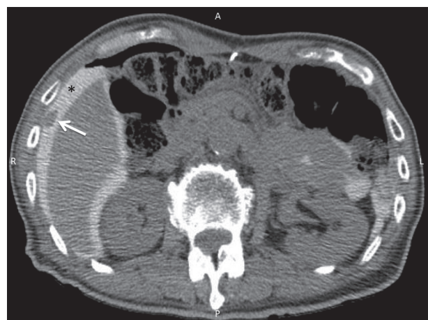
Figure 2. After hydrodissection, the nodule was identified as a peritoneal implant (white arrow). Black asterisk indicates hydrodissection fluid